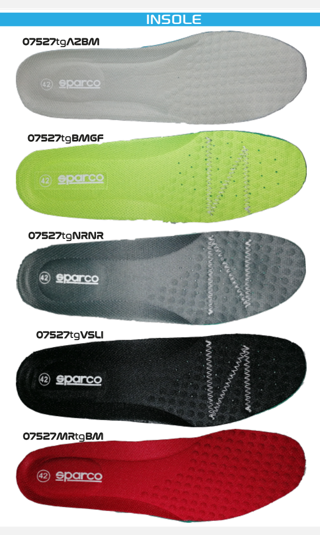
INSOLE in PU with ergonomic thermo-forming

in velour microfibre and breathable micro-perforated fabric. Additional colored laces included.